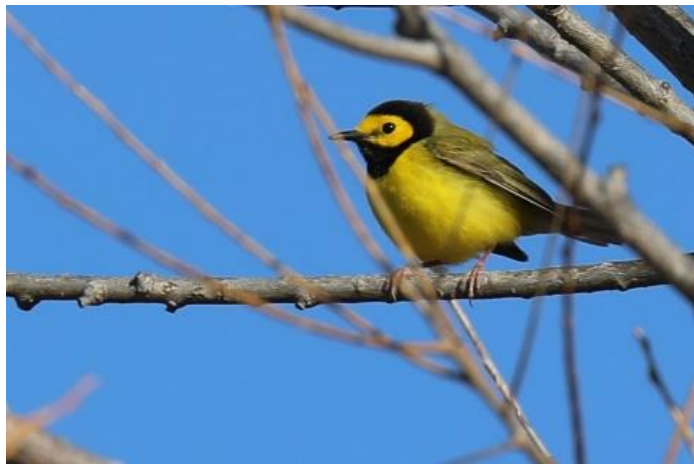
Hooded Warbler

I told a friend of mine at work about it. He is a really good photographer, but just getting into bird ID. He went and got pictures, and also took pictures of other birds that were around. Afterwards he asked me what they were, and I couldn't believe he had pictures of two more rarities for here, a Summer Tanager and a Cassin's Vireo.